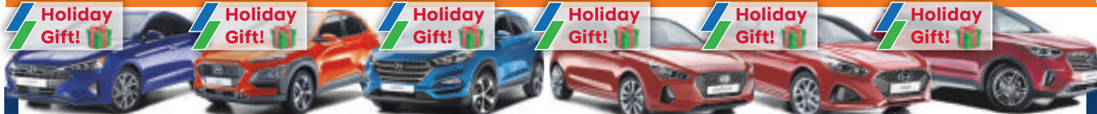
Ultimate model shown*

DON'T PAY FOR 90 DAYS ^ BASED ON MONTHLY PAYMENT FREQUENCY. ON SELECT FINANCE PURCHASES OF NEW HYUNDAI VEHICLES, WITH THE EXCEPTION OF THE DOWN PAYMENT, IF APPLICABLE. RESTRICTIONS APPLY. PLUS GET GREAT DEALS ON THE HEATED FEATURES YOU WANT